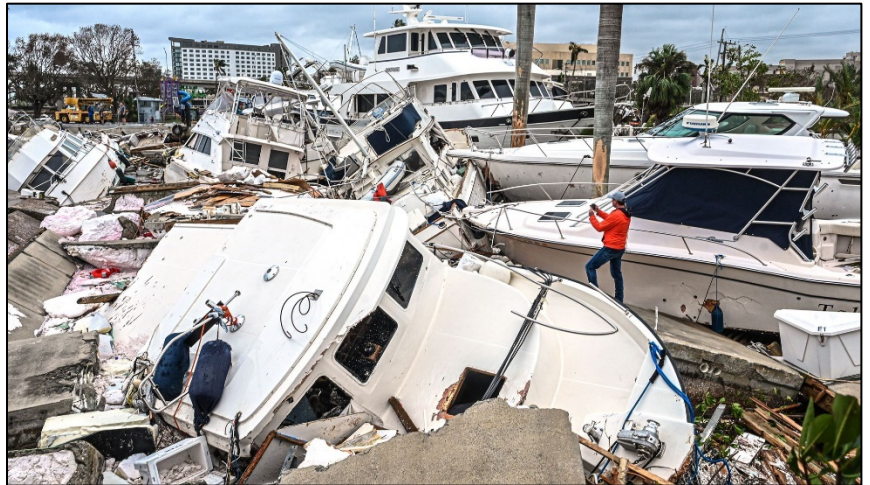
Boats damaged by Hurricane Ian in Fort Myers, Florida, in September 2022.

Other natural catastrophes of 2022 include European winter storms, flooding in Australia and South Africa, and hailstorms in France and the United States, the report said. The $4 billion in flooding losses in Australia in February and March comprised the country’s costliest-ever natural catastrophe, Swiss Re said.