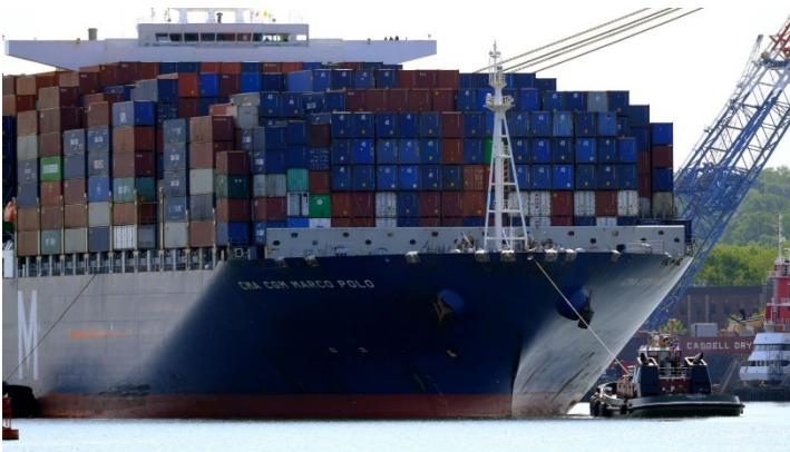
Port Authority welcomes biggest ship ever seen in NYC

Logistics managers have been saying for months that trade was being redirected due to the labor issues at West Coast ports and several links in the transportation network, including rails, have begun using new models to route shipments across the country based on changes in port usage.